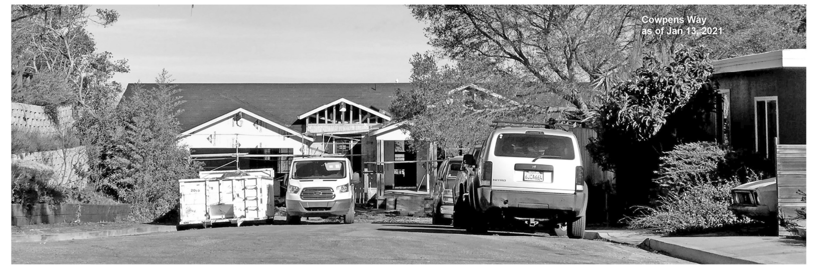
Cowpens Way as of Jan 13, 2021