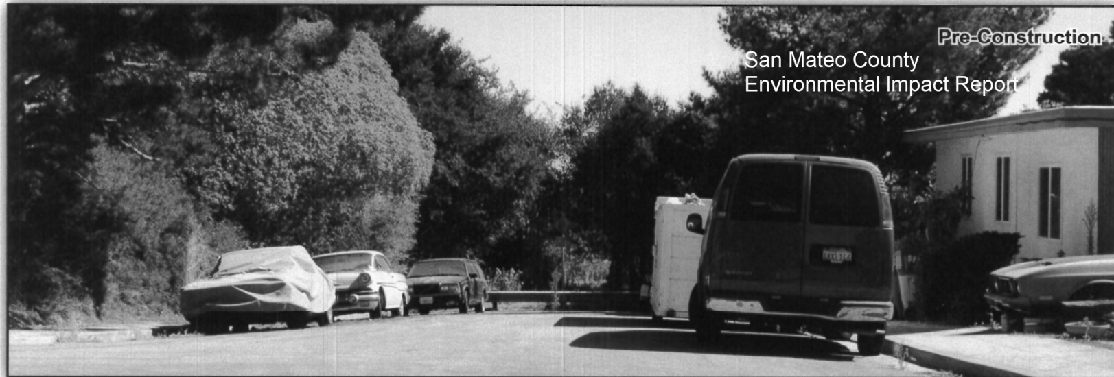
Pre-Construction San Mateo County Environmental Impact Report