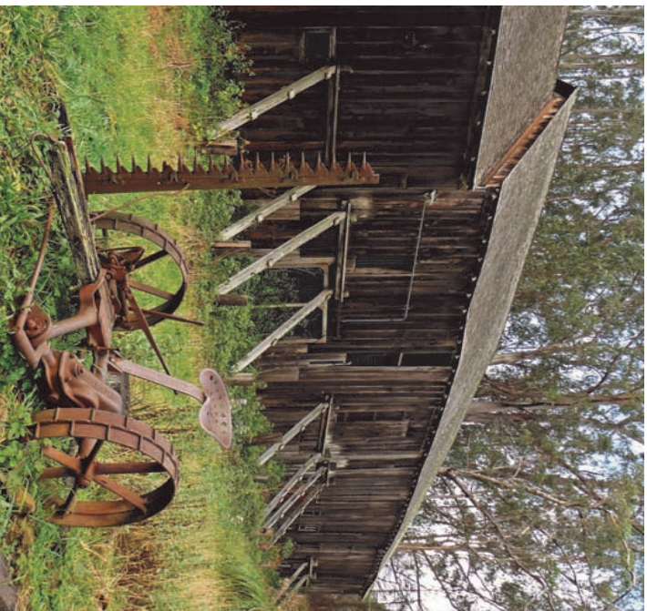
Robert Mills Dairy Farm, Half Moon Bay