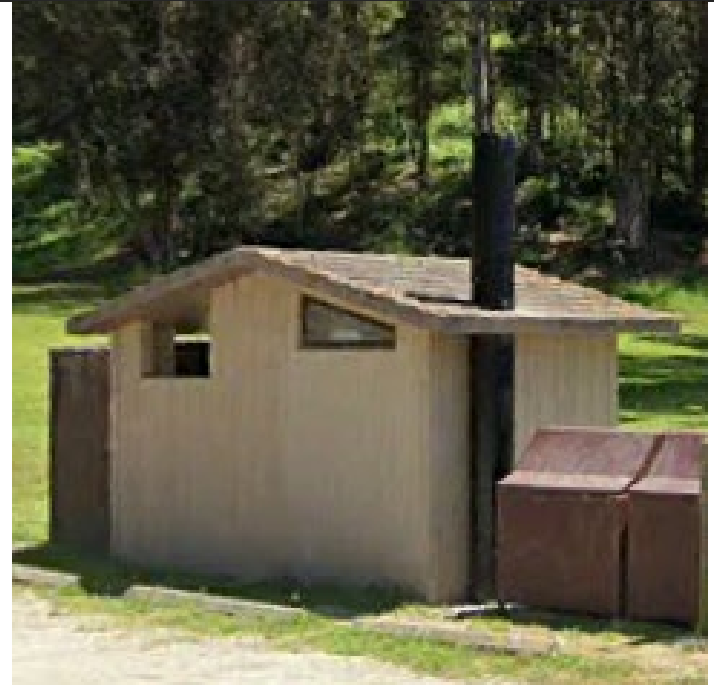
Photo 10b. Single-vault toilet near park entrance. Example of structure to be installed near pump track