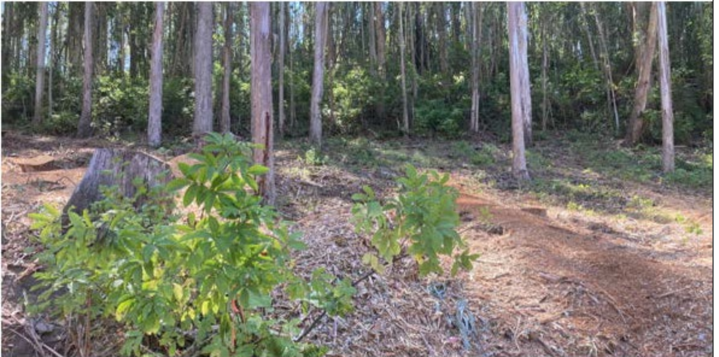
Photo 2. Example of a shaded fuel break with thinned trees and understory brush removed.