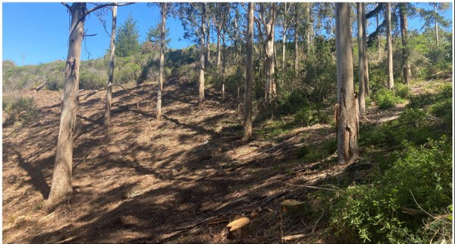
Photo 6. Example of area after with hazard tree after removal.