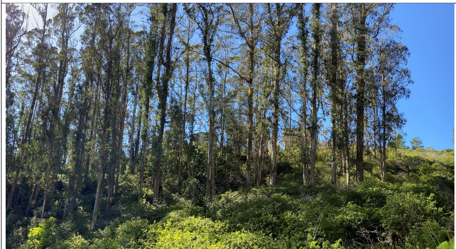
Photo 8. View of fuel reduction area along western park boundary looking northwest toward homes along El Granada Boulevard.