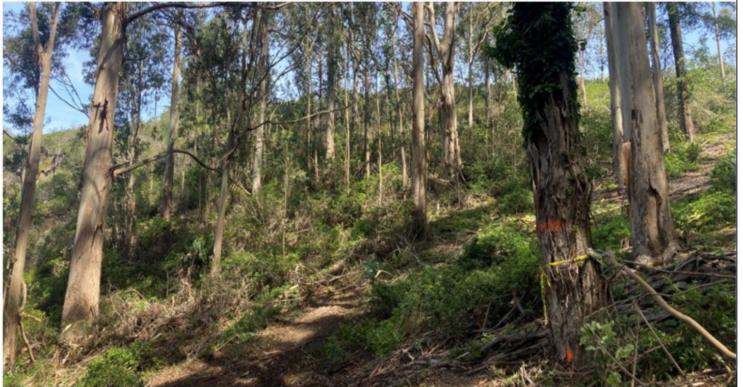
Photo 5. Example of a hazard tree prior to removal.