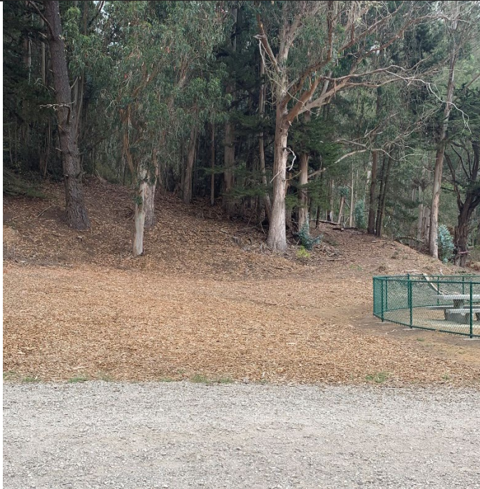
Photo 10a. Location of proposed vault toilet adjacent to (left of) the pump track area.