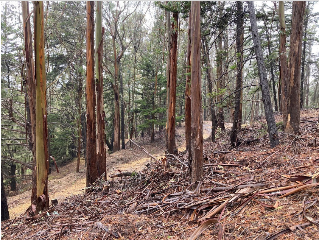
Photo 4. Fuel break area after treatment with thinned trees and understory brush removed.