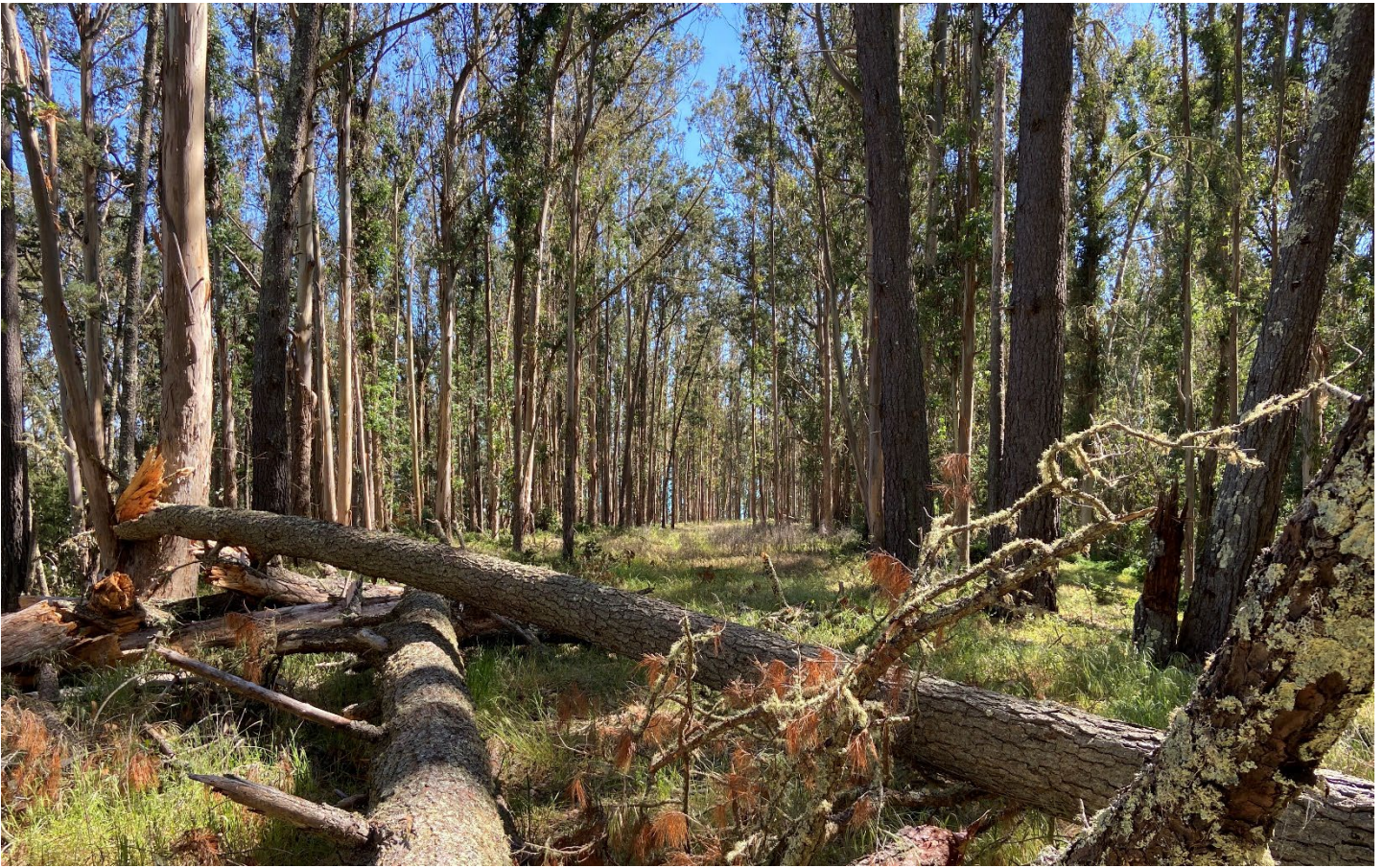
Photo 9. View of proposed South Ridge Fire Road alignment looking southwest toward Coronado Road.