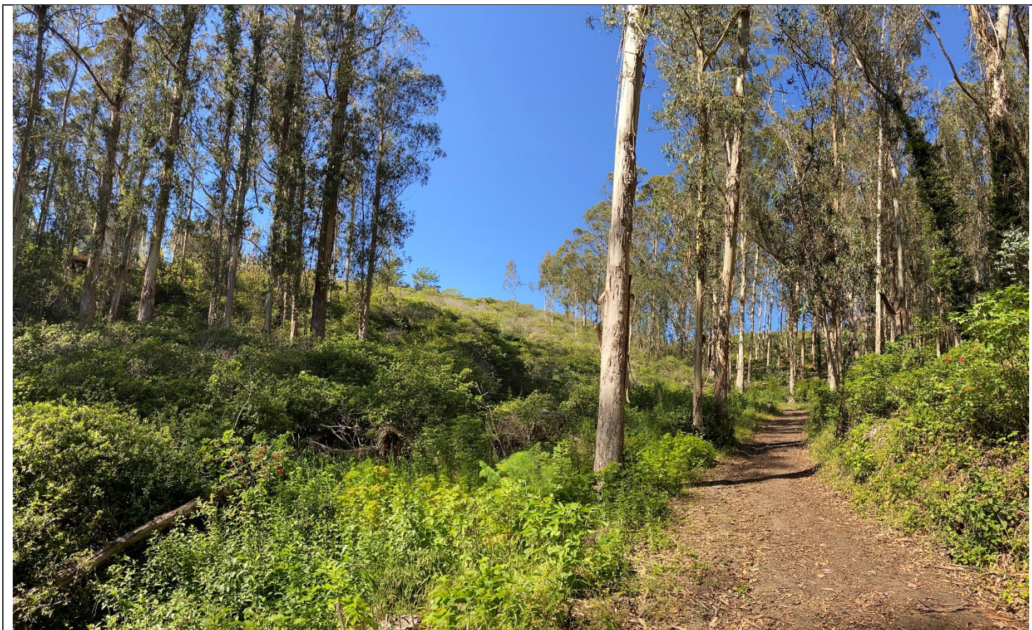
Photo 7. View of fuel reduction area along western park boundary looking north.