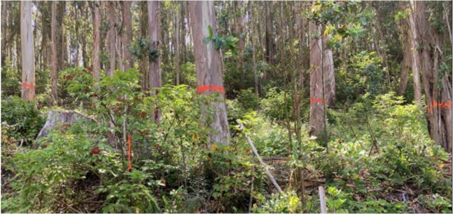
Photo 1. Example of park vegetation requiring fuel reduction to reduce wildfire hazard prior to treatment. Large diameter hazard trees are tagged with orange paint for removal.