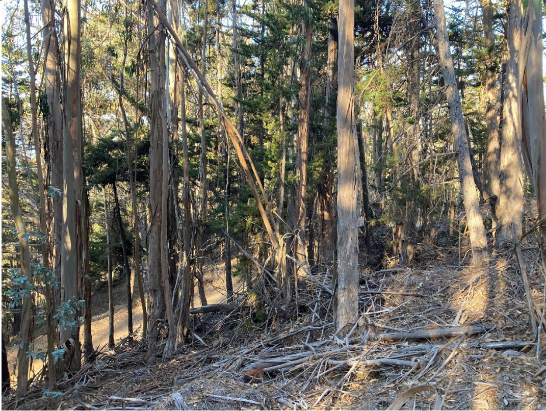
Photo 3. Example of fuel break area prior to treatment.