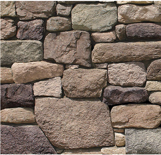
WALL – CORONADO VIEJO BLEND