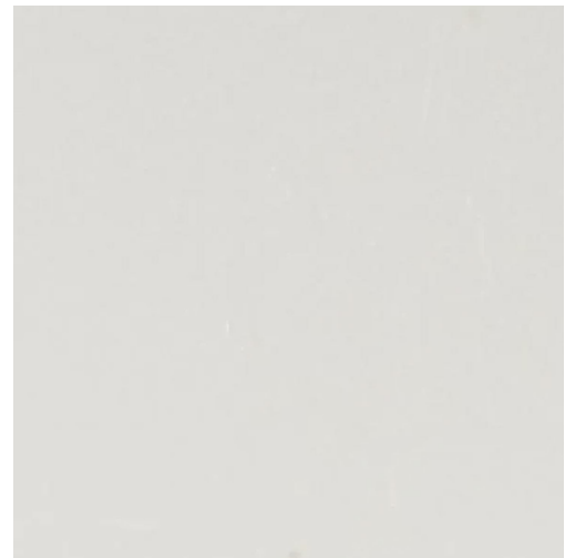
STUCCO 2 DOVE GREY - LRV:29