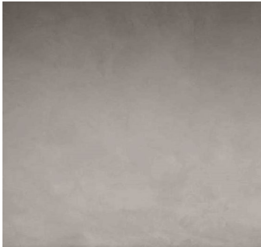
STUCCO 1 FANGO – LRV 31